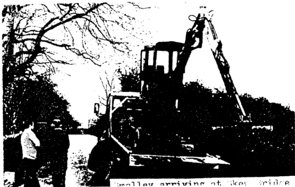
Bucket arriving at river bridge