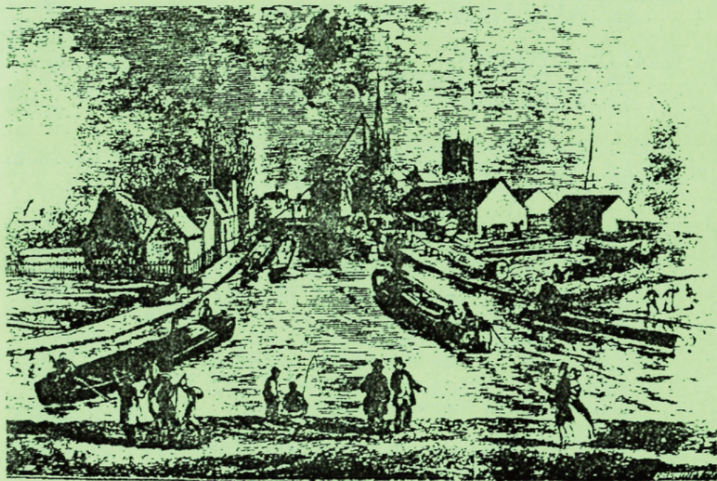
Middle Basin of the Hereford and Gloucester Canal.

JOURNAL OF THE HEREFORDSHIRE & GLOUCESTERSHIRE CANAL SOCIETY.